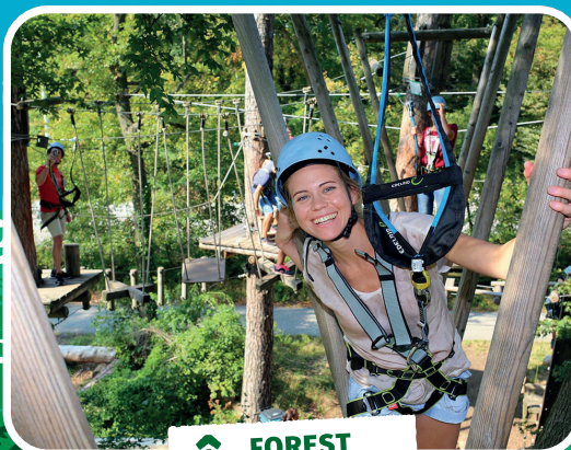
FOREST ROPE PARK