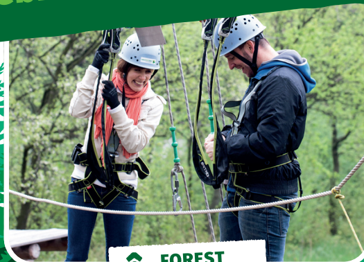
FOREST ROPE PARK