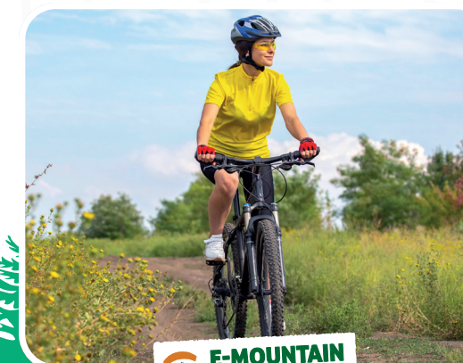
E-MOUNTAIN BIKE CENTER