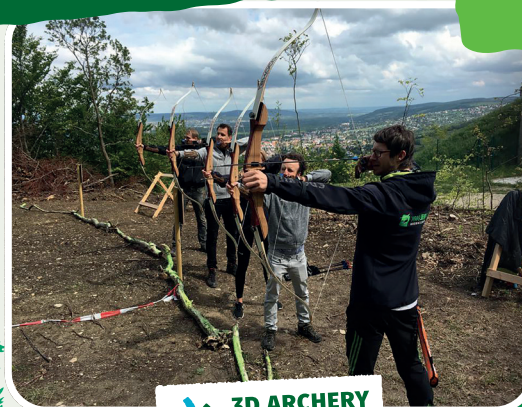
3D ARCHERY PARK