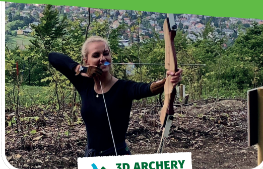
3D ARCHERY PARK