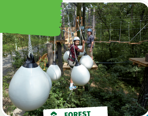
FOREST ROPE PARK