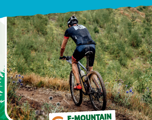
E-MOUNTAIN BIKE CENTER

We will be happy to advise you on the organisation of your daily schedule. If you are interested, we can offer you a seminar room with flipchart and TV for up to 25 people.